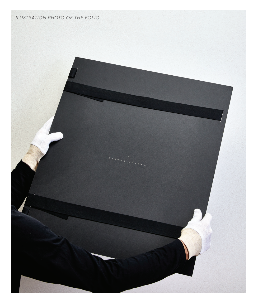
PRICE PRINT PRESENTED IN CUSTOM FOLIO €540