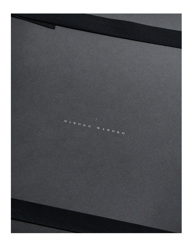
CUSTOM FOLIO WITH FINE PAPER SLEEVE MEETING STRICT ARCHIVAL STANDARDS. CERTIFICATE OF AUTHENTICITY