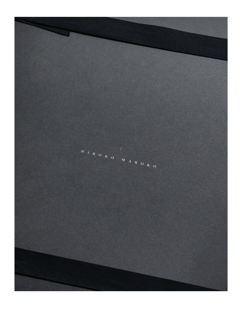
CUSTOM FOLIO WITH FINE PAPER SLEEVE MEETING STRICT ARCHIVAL STANDARDS. CERTIFICATE OF AUTHENTICITY