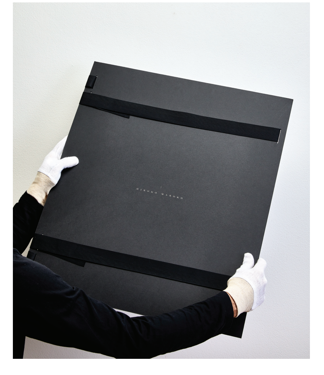
DIMENSION 35CM • 40CM